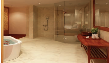
Junior Suite Bathroom