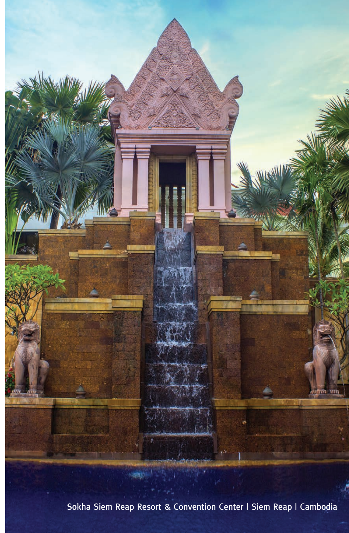
Sokha Siem Reap Resort & Convention Center | Siem Reap | Cambodia